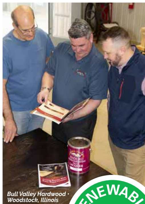
Bull Valley Hardwood • Woodstock, Illinois

“Over several visits to our factory, the General Finishes sales reps evaluated the scope of our business, fine-tuned our custom colors, and made product suggestions. They helped us make the transition from solvent- to water-based stains and topcoats. While doing that, they noticed we also paint, and suggested we convert to General Finishes painting system. We did and love the improved coverage, ease of use, water cleanup and the reduced VOCs of all their products while on the production line.