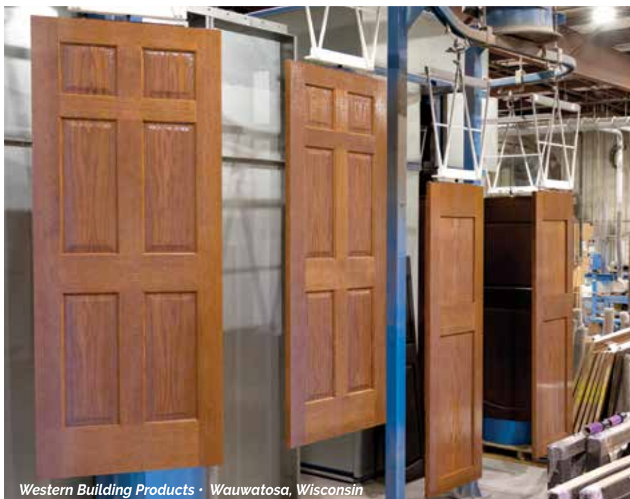
Western Building Products • Wauwatosa, Wisconsin

General Finishes manufactures wood coatings made with more than 50% renewable resources, formulated from sustainable materials that decrease the carbon footprint, such as vegetable oils and plant proteins. All our products exceed KMCA performance requirements, and are formaldehyde-free and HAPS-free.