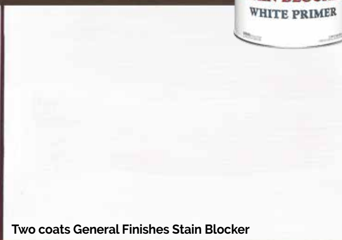
Two coats General Finishes Stain Blocker

Stain Blocker is a white primer formulated to block tannins and stain bleed-through that cause discoloration. Use as a base coat when maximum protection is required over MDF, raw wood with high tannins, and existing finishes that will be painted white or light colors.