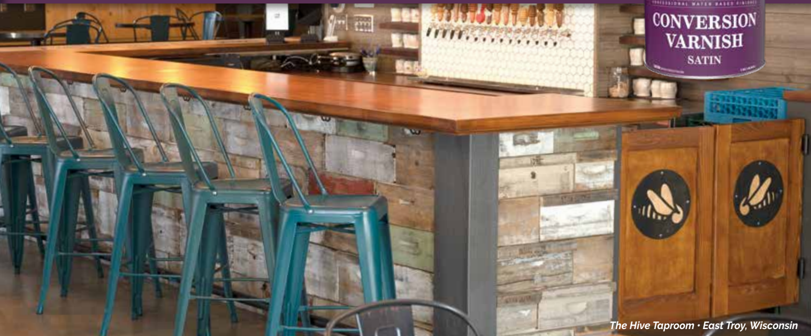
The Hive Taproom • East Troy, Wisconsin

Conversion Varnish is a clear 2K topcoat for the most demanding, high-use commercial and residential applications. Suitable for interior and exterior projects, this is the most durable topcoat in the entire General Finishes product line and significantly outperforms solvent-based conversion varnishes.