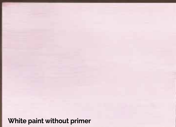
White paint without primer