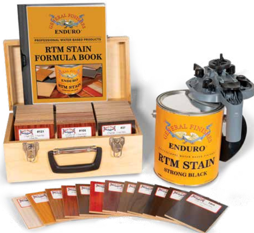
RTM Chip Box in Oak and Maple or Alder and Maple

Ready-to-Match (RTM) Stains are made with dye/pigment combinations. They come in 12 stock colors and a clear base that can be intermixed to create an endless number of colors. The RTM system allows professionals to efficiently match any existing stain with ease.