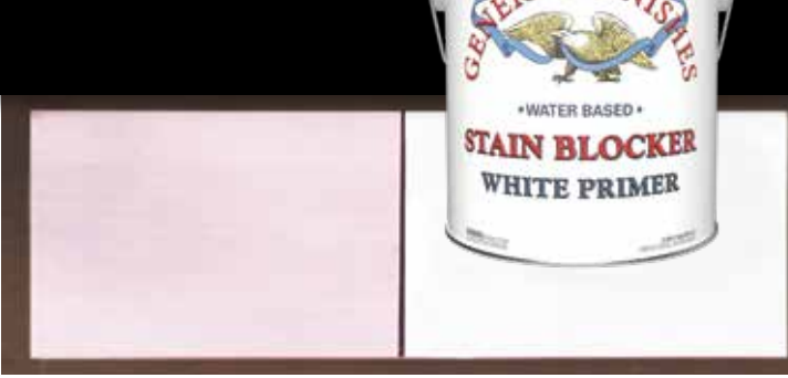
After 40 minutes over General Finishes Merlot Dye Stain.

Stain Blocker is a white primer formulated to block tannins and stain bleed-through that cause discoloration. Use as a base coat when maximum protection is required over MDF, raw wood with high tannins, and existing finishes that will be painted white or light colors.