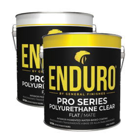
Pro Polyurethane Clear & White are self-crosslinking polyurethane/acrylic topcoats engineered for the competitive contractor market with fast build and 2-coat hide properties.