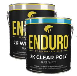
2K Clear & 2K White Poly are tintable <u>2-component polyurethane topcoats</u> that provide ultimate durability for any commericial application.