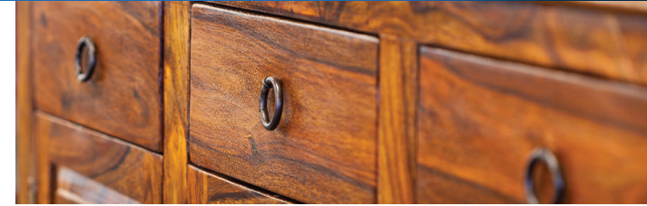
Samples on oak