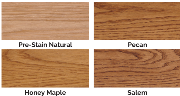
Samples on oak